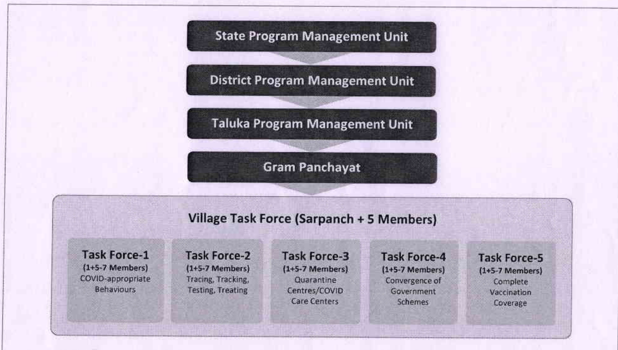
Figure-1: Support Structure of the CFV Program

The CFV program is implemented in the state as a government initiative. The State Government issues suitable orders and declares Covid-free Village competitions with prizes in different categories awarded to winning Gram Panchayats. Participation in the program is demand-driven; and Gram Panchayats desirous of joining the program and competition submit applications to Taluka Administration. The State Government supports implementation by establishing Program Management Units at State, District and Taluka levels, nominating Nodal Officers for coordination with stakeholders.