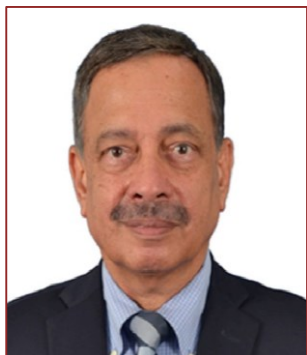
Air Marshal Bhushan Gokhale (Retd.) VSM, AVSM, PVSM