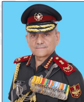
General Anil Chauhan PVSM UYSM AVSM SM VSM Chief of Defence Staff (CDS)